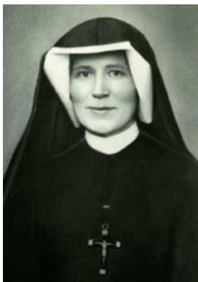
ST. MARIA FAUSTINA KOWALSKA 1905 - 1938